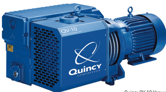
Quincy QV-10 Vacuum

Outside of a yearly oil and filter change, there are no other items that require routine servicing. Our non-metallic vanes are designed to have a service life of at least 35,000 hours. This adds up to more service life between overhauls.