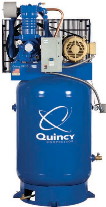
QP MAX Unit Package / QP-10 Vertical