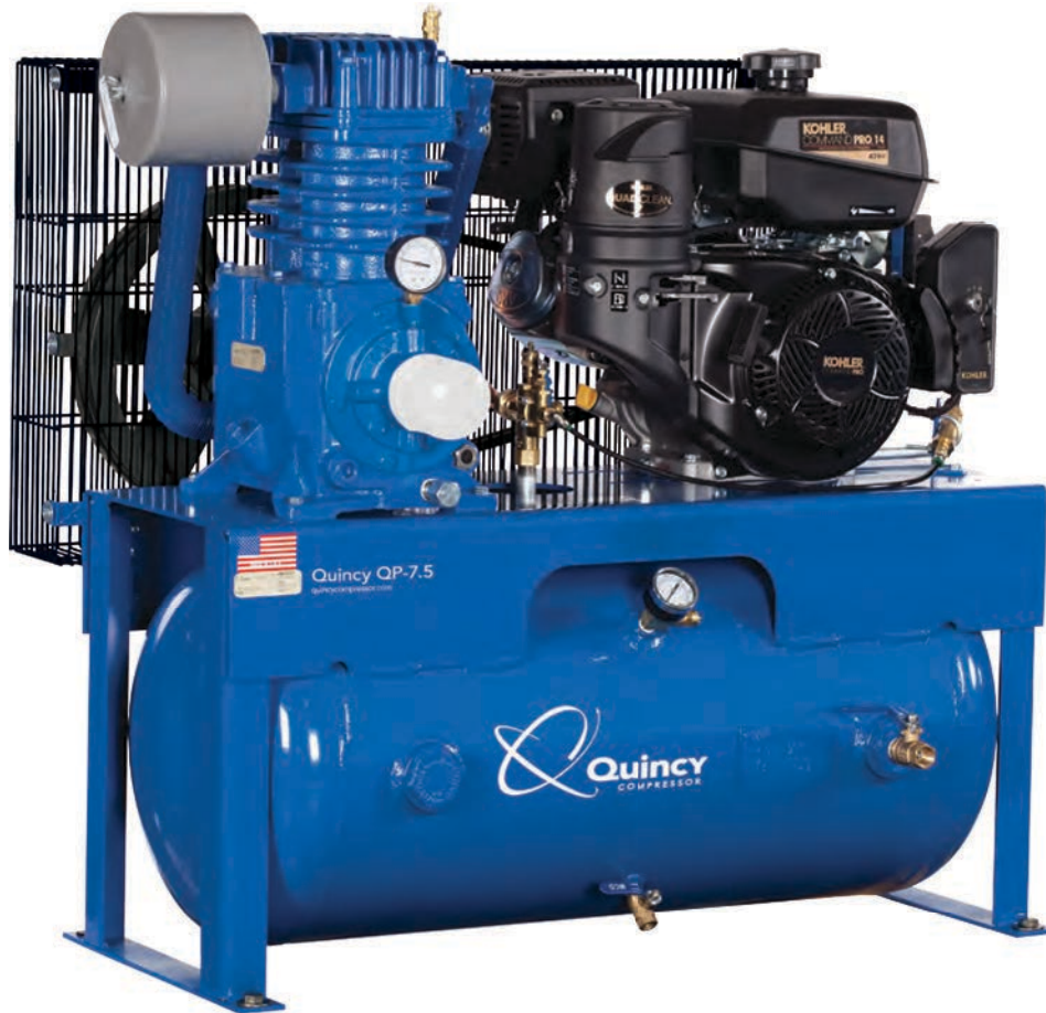
QP-7.5 with Kohler Engine

* Must purchase associated kit at the same time as the compressor to receive warranty extension